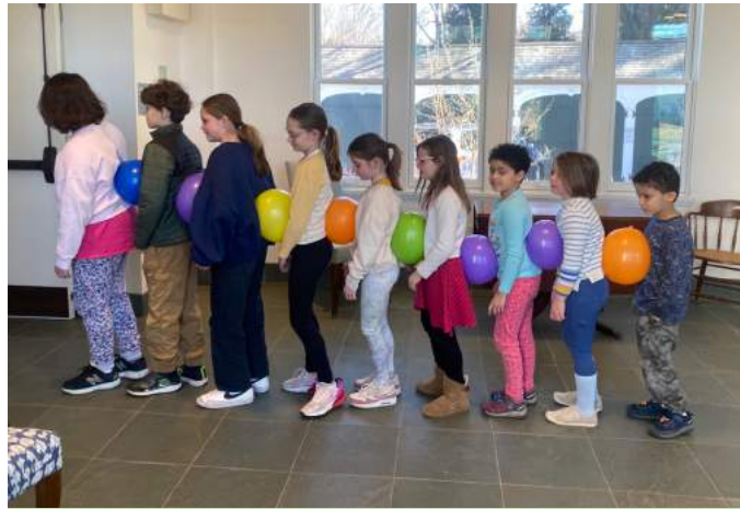
How do you move eight balloons from one place to another without using your hands? Children in the SEEK program don't just talk about the importance of working together — they practice it!

In February our theme was transformation and in March our theme was equity and justice. With both themes we talked about the importance of working together to make change.