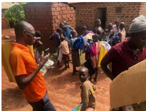
In spring 2023, First Parish volunteers packed up gently used clothes and household items for shipment to Uganda (top). The shipment took several months to arrive at its destination in Uganda (bottom).