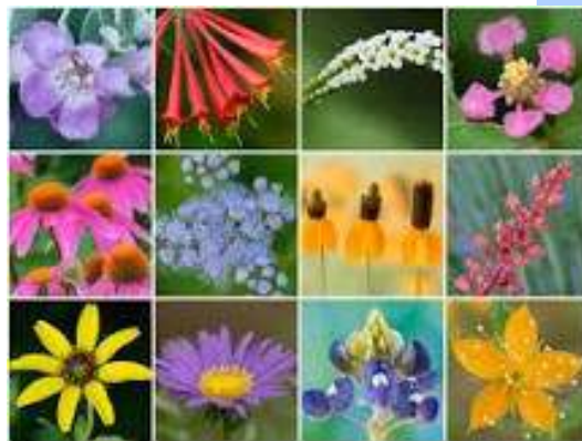
A native plant consultation will be just one of many exciting offerings at the First Parish Auction on March 23.

We'd welcome new ideas for auction items. Do you like to cook? Perhaps you'd like to host a small dinner in your home, or offer to deliver one to the home of the winner. Like to bake? Perhaps you'd like to offer your favorite item, to be delivered on a mutually agreeable date with the buyer. Handy at the sewing machine? Quilts, woven goods, needlepoint, and other handmade items are popular. Have lovely artwork hiding in a closet? Perhaps someone else might enjoy it. Receive a holiday gift card that's not your jam? We'll take it!