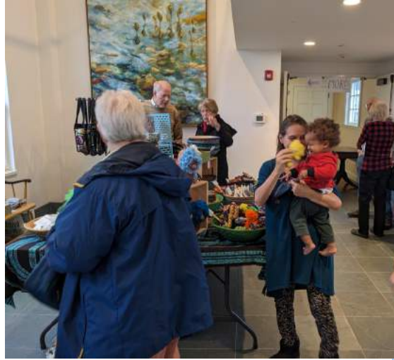
The Holiday Pop-Up Sale met the needs of shoppers and sellers alike.