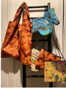
The Uganda Project will sell crafts like these made at the Kampala School for the Physically Handicapped, where First Parish has shipped craft supplies.

First Parish in Wayland's Holiday Sale will feature items from our own Fair Trade Project and the Uganda Project, handmade items from other nonprofits, and gently used holiday décor. The Kids' Shop will offer low-cost items where kids can shop for family and friends.