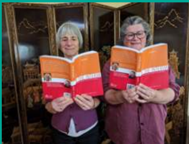
And for those who are interested in a little light reading, the Interim Minister Search Committee has left two copies of In the Interim, Strategies for Interim Ministers and Congregations (Barbara Child and Keith Kron, Editors) on the round table in the Commons.